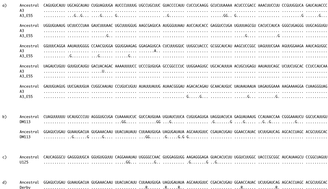
Figure 1 Sequences of the gene encoding the PP3 protein of sigma virus that contain clusters of A to G mutations. The sequences are shown in positive sense (the mRNA sequence rather than the genome sequence). (a) Isolates A3 and A3 E55 (2'916 - 2'316). These were laboratory maintained lines that were split from each other ~15 years ago. (b) The field isolate DM113 (3'194 - 2'954). (c) The field isolate U125 (2'693 - 2'574). (d) The field isolate Derby (3'074 - 2'954). This isolate was polymorphic for five A to G changes in the PP3 protein (these ambiguous bases are indicated by the wobble code R). In all the panels, sites that have not been mutated are represented by a period and the ancestral sequences were reconstructed by parsimony using a phylogeny of the viral sequences. The nucleotide locations refer to the position in negative sense genome of Genbank accession AM689308 (isolate A3).

of the gene encoding the PP3 protein (Figure 1). However, this is a special case, as these five changes are polymorphic at these sites (both As and Gs are present in the RNA extracted from a single infected fly line), suggesting that only a proportion of the viral genomes have been edited. Again, we tested whether sites preferred by ADAR were more likely to have mutated, but found they were not (Table 1). Other than these two examples, there was a