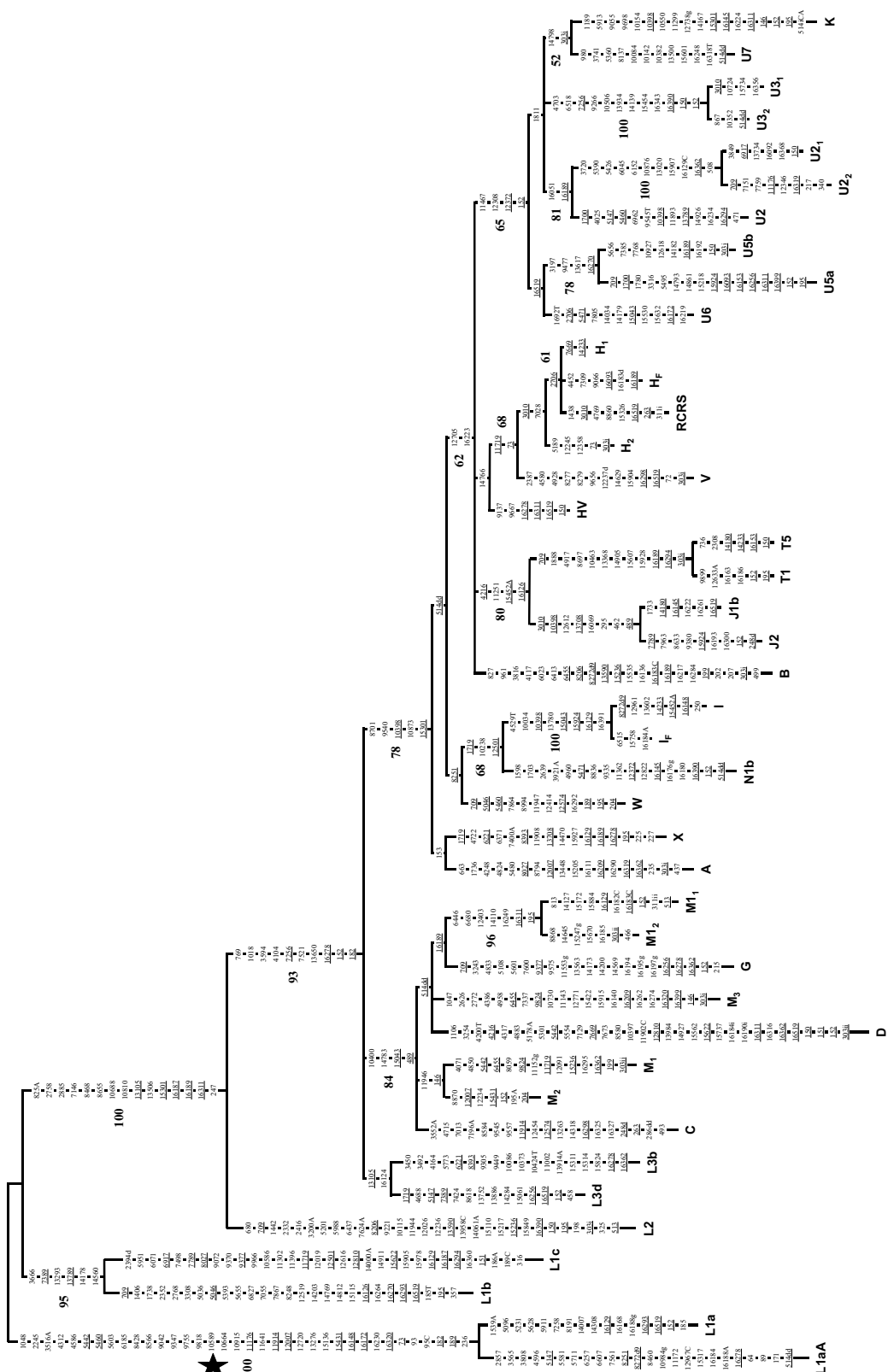
Figure 1 Phylogenetic network based on complete mtDNA genome sequences. Nomenclature of individuals is as in Table 1. Numbers along the links refer to nucleotide positions; suffixes are transversions; and underlining indicates recurrent mutations; the order of the mutations on a path not interrupted by any branching or distinguished nodes is arbitrary. The same topology was supported by bootstraps, using Nj and 1000 replicates; the bootstrap values higher than 50% are shown over the branches. The star shows the position where the chimpanzee sequence roots in the network.